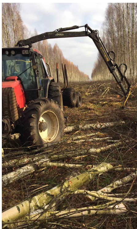
Clearing of woody vegetation at Amalva peatland.

The first step in peatland restoration is to restore optimal water levels and the peatland's hydrological functions. Blocking ditches and drains with natural or synthetic materials slows