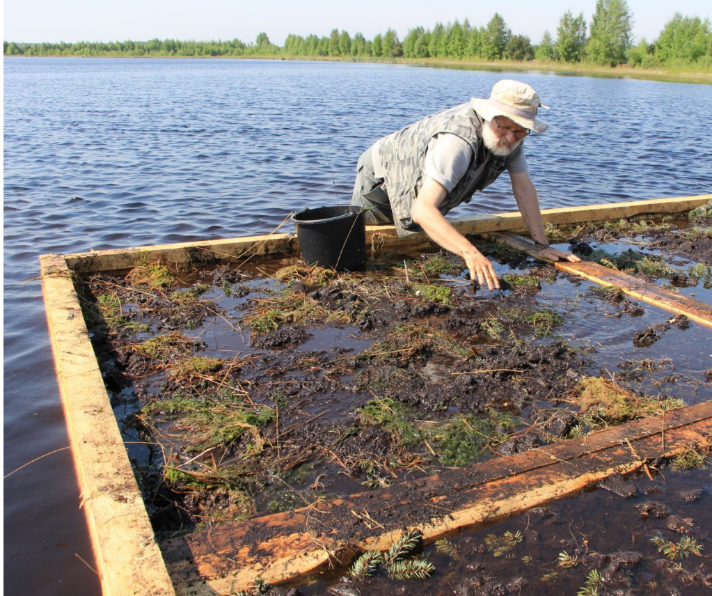
Sphagnum growth on a floating island in Poland, Slowinski National Park.

It is possible to reduce GHG emissions from degraded peatlands by rewetting and restoring them. Each tonne verified as saved can be offered for sale as a carbon credit. Carbon credits can represent an important potential income for landowners and farmers, and their implementation can fund restoration and sustainable peatland management.