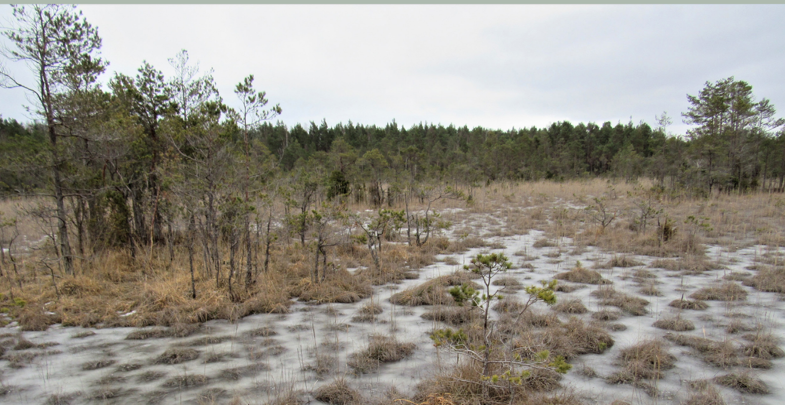
Photo: Engure, Latvia.

EU Environmental Impact Assessment (EIA) Directive, Green Infrastructure policy