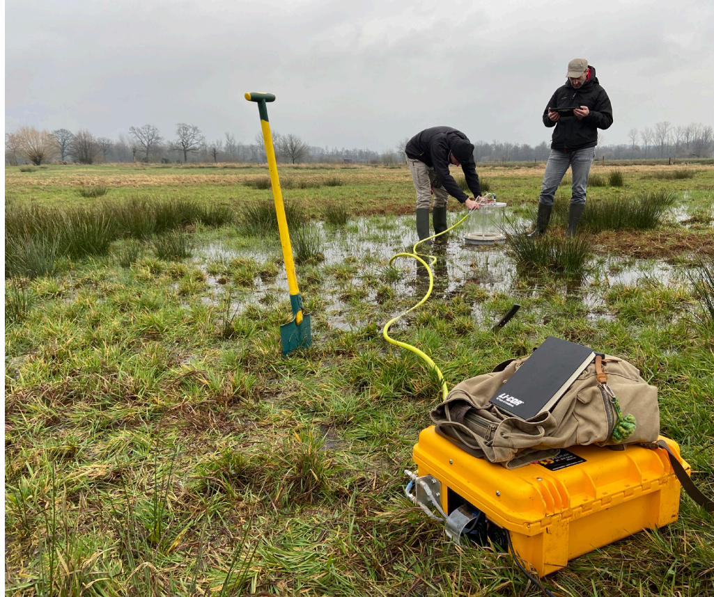
Taking GHG measurements at Valleij van de Zwarte Beek, Care-Peat

The annual balance of GHG emissions were modelled, based