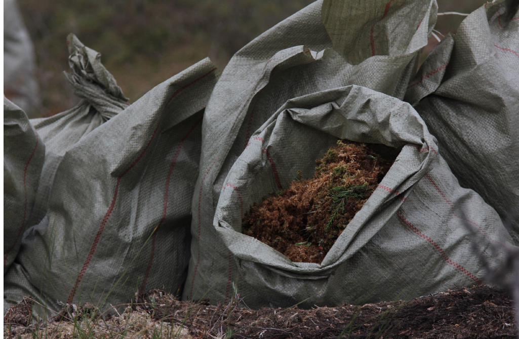
Bags of Sphagnum during the first day of collecting donor material at Aukštumala peat bog.

down water loss, allowing water levels to rise. This creates the right conditions for a peatland's