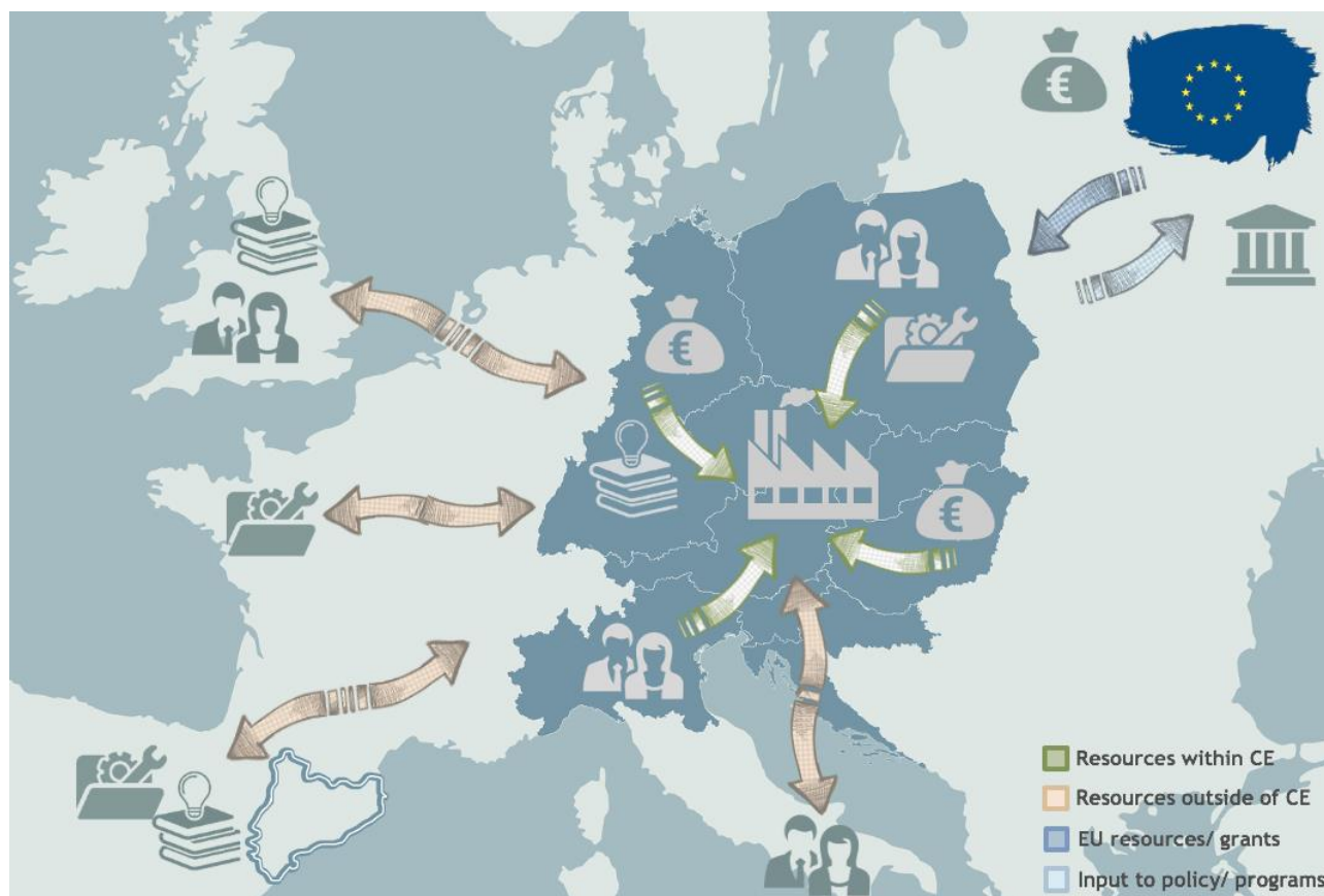
Figure 2 The cross-border approach - Pulling the resources together

A framework that provides tailored and flexible support services that follow high quality-standards both on a local level as well as in the international context is key to a successful uptake of emerging technologies for “smaller” players. Especially a connection to the value chains/ markets and the relevant knowledge is important. As challenges are global, a cross-border Alliance such as AMiCE can be an important driver: